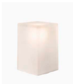
Sand Blasted Pressed Glass