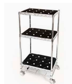
Medium Recharging Trolley 36 Lamps