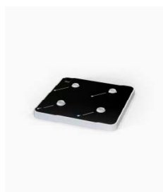
Small Recharging Tray 4 Lamps