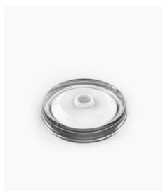
Single Base Station 1 Lamp

POWER SOURCE 100 - 240V Switch-Mode Electronic Power Supply Approved for worldwide usage supplied with appropriate mains electric plug type