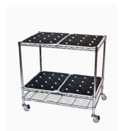
Large Recharging Trolley 48 Lamps