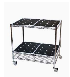
Large Recharging Trolley 24 Egg Medium Lamps*