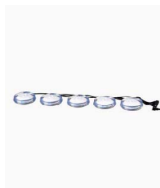
5 Way Power Distributor 5Lamps