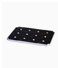
Large Recharging Tray 6 Egg Medium Lamps*