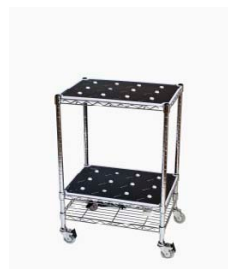
Small Recharging Trolley 12 Egg Medium Lamps*