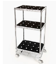
Medium Recharging Trolley 36 Lamps