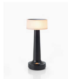
Anodised Satin Black Aluminium