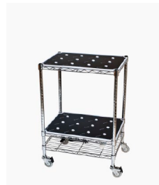
Small Recharging Trolley 24 Lamps