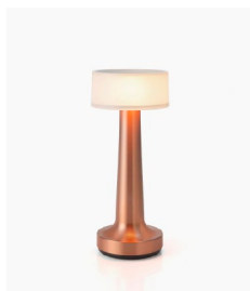
Lacquered Real Copper