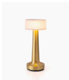
Lacquered Real Brass