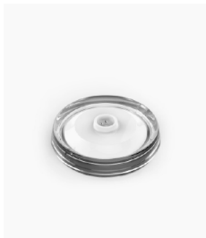
Single Base Station 1 Lamp