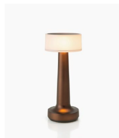
Anodised Satin Bronze Aluminium