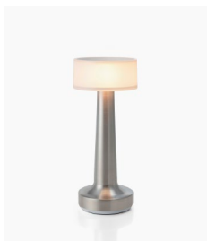
Anodised Silver Aluminium