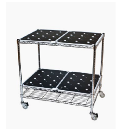
Large Recharging Trolley 48 Lamps